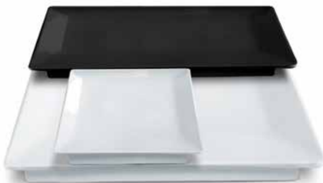
PIATTO QUADRO SUSHI Sushi Square Plate