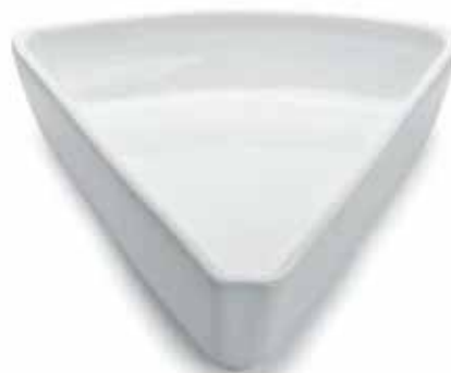
PIROFILA TRIANGOLARE Triangular Dish