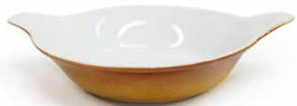
TEGAME TONDO UOVO Round Egg Pan