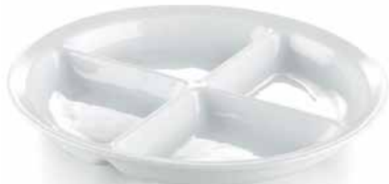
PIATTO 4 SCOMPARTI 4 Sections Plate