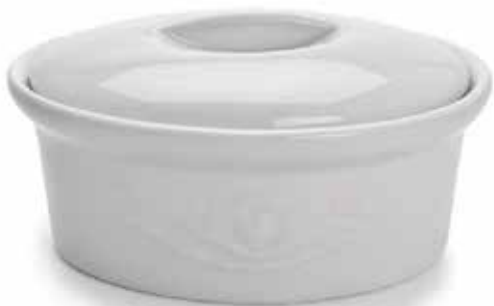
TERRINA OVALE CON COP. / CC150 Oval Terrine With Lid