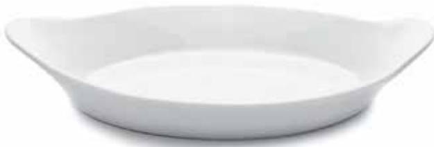
TEGAME OVALE UOVO Oval Egg Pan