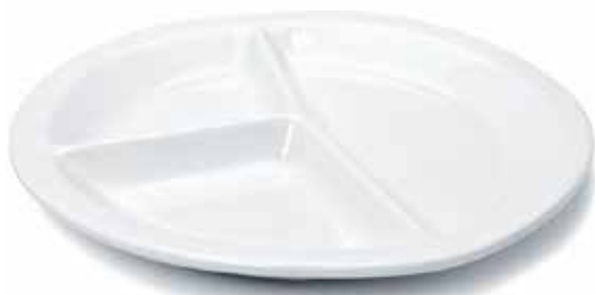
PIATTO 3 SCOMPARTI 3 Sections Plate