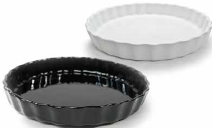
TORTIERA Pie Dish