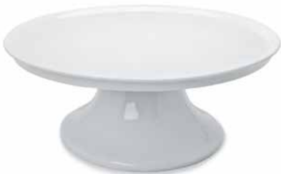
ALZATA TORTA Cake Stand