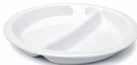
PIATTO 2 SCOMPARTI 2 Sections Plate