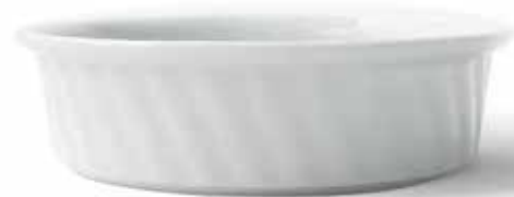
COPPETTA CREMA CATALANA