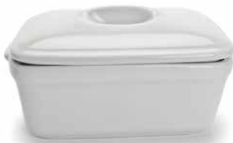
TERRINA RETTANGOLARE CON COP. / CC300 Rect. Terrine With Lid