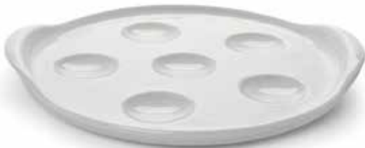
TEGAME LUMACHE Snails Pan