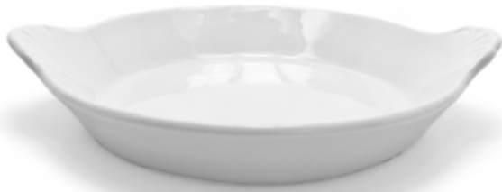
TEGAME UOVO FREGI Fregi Egg Pan