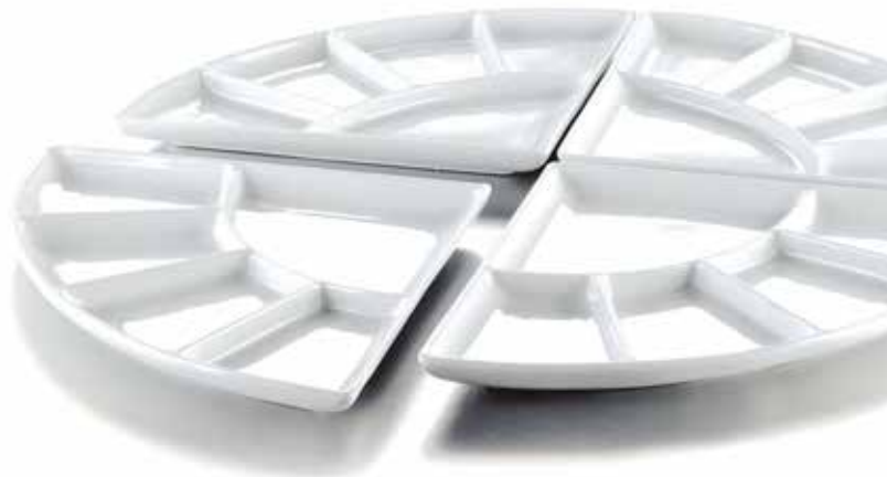
PIATTO BOURGUIGNON Bourguignone Plate