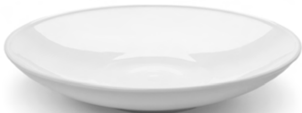
PIATTO CUP Cup Plate